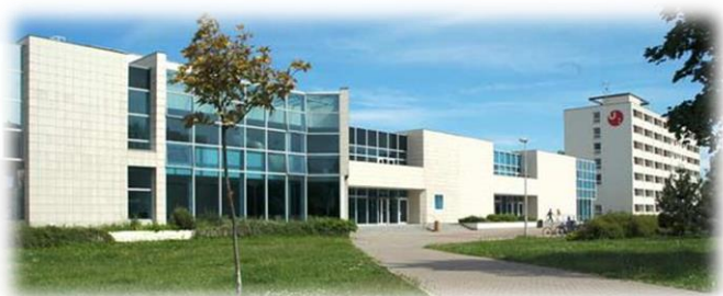
Venue – lecture hall A1, University of Pardubice