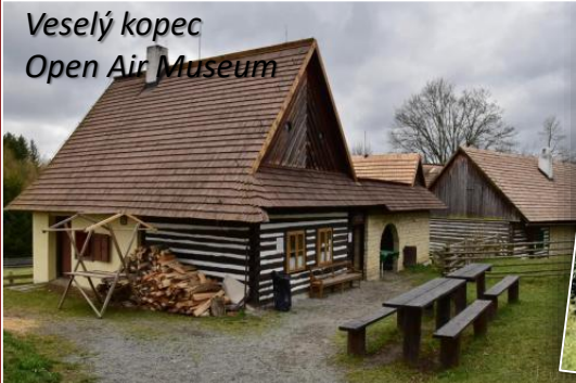
Veselý kopec Open Air Museum