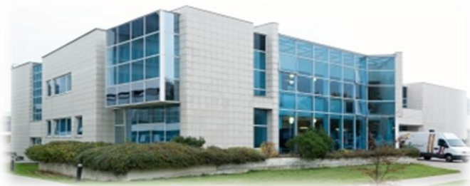
Venue – lecture hall A1, University of Pardubice